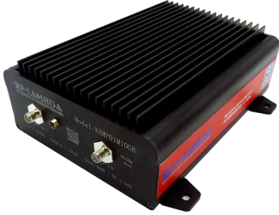
Note: Photo is for illustration purposes only. Please refer to outline drawing.